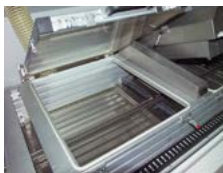
Flexible preheating concept: medium and short-wave emitters