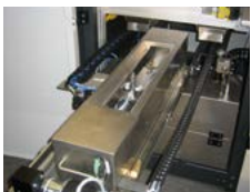
Maintenance-friendly spray fluxer designed to meet highest demands in lead-free soldering

Many lead-free solders are considerably more aggressive towards currently used metals and stainless steels than the established SnPb solders. This fact is a huge challenge for solder modules. For this reason, the Ersa POWERFLOW e N 2 is manufactured with high-quality materials, the surfaces of which are additionally subjected to a multilevel treatment. This renders them passive so that the solder does not react with them. The solder nozzle design has to meet changing requirements, depending on whether the nozzles are working within an N 2 or a normal atmosphere, with lead-free or Pb solder. The somewhat tougher oxidized skin that forms under normal atmospheric conditions requires altered nozzle designs for the solder to flow off in the direction of transport. It is also necessary to consider the somewhat greater bridging tendency caused by the solder's higher surface tension. Apart from the familiar PowerWave soldering nozzles, Ersa also offers further nozzle designs, depending on the process and the application.