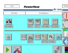
State-of-the-art control with graphic user interface and touchscreen