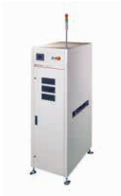
FIFO Buffer No Magazine Buffer FIFO/LIFO Pass-Through