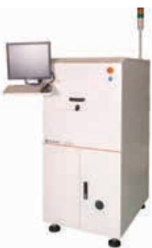
Laser Cell Medium Size