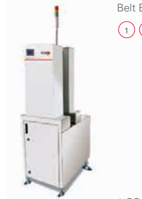
Belt Buffer LIFO