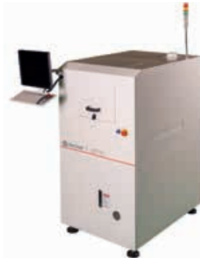
Laser Cell Large Size