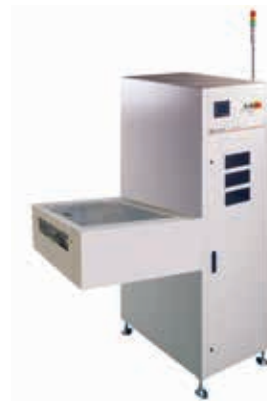
Combo Buffer Single Magazine Buffer FIFO/ LIFO/ Pass-Through